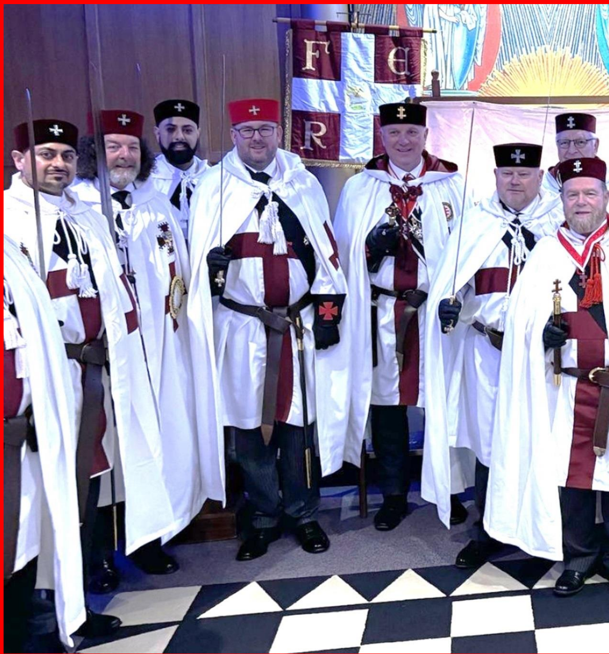
Several sword-drawn members of the Bodyguard with the Provincial Prior.