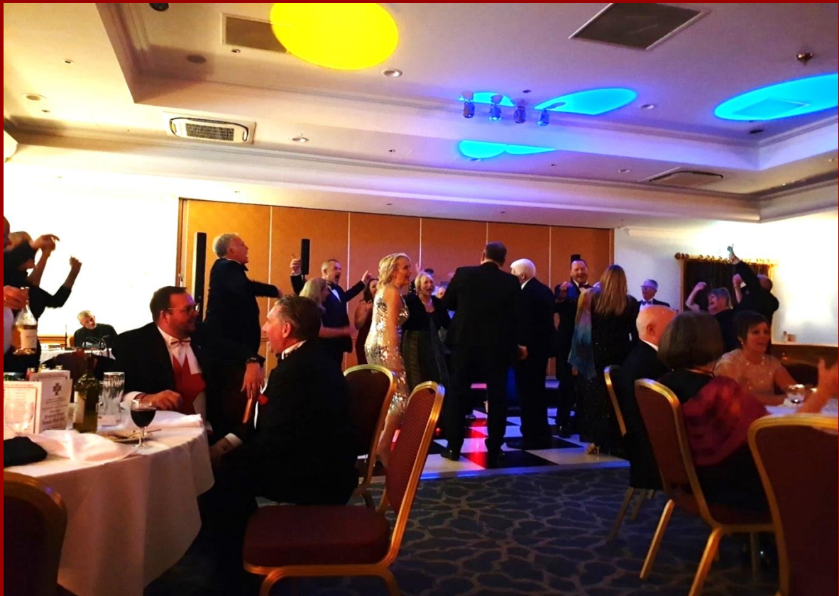
The fantastic DJ blasted his music and we began hitting the dance floor.