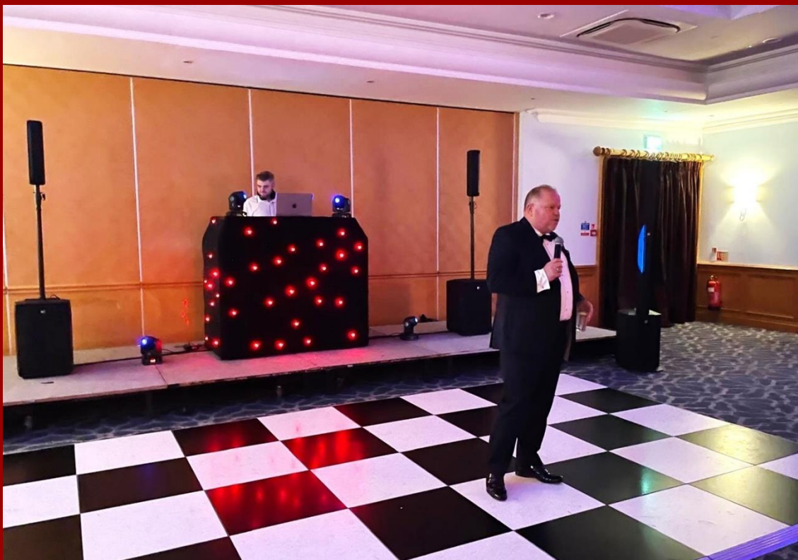
The Commander of the Provincial Prior's Bodyguard speaketh!