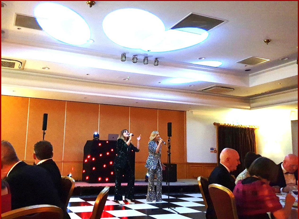
Then came the remarkably talented D-Day Dollies duo!