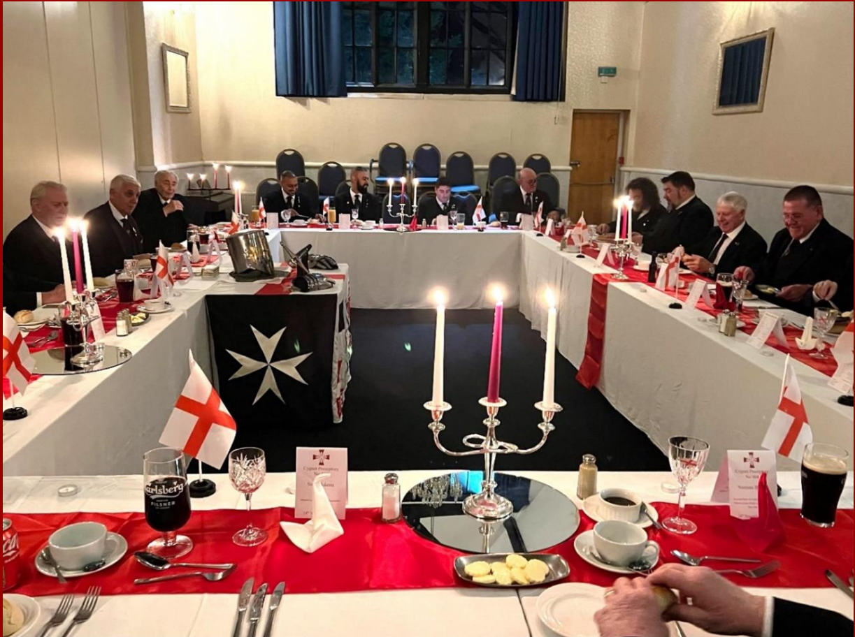
Brother Knights enjoying the Festive Board.