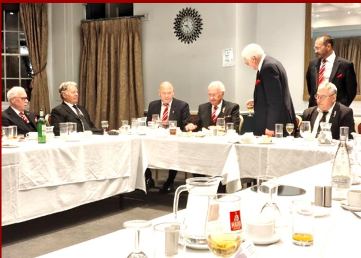
The new Eminent Preceptor with the Provincial Sub-Prior.