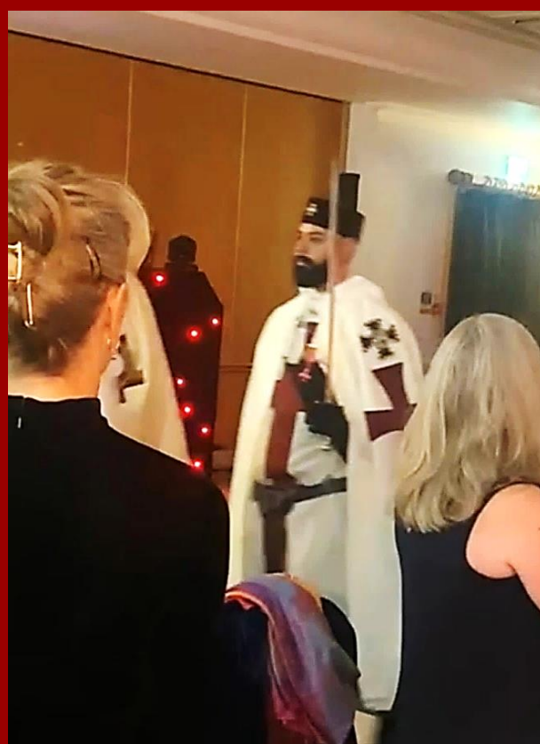
BODYGUARD, LEFT AND RIGHT TURN! AND MARCH! (then quickly get changed into your dinner jackets and join the guests!)