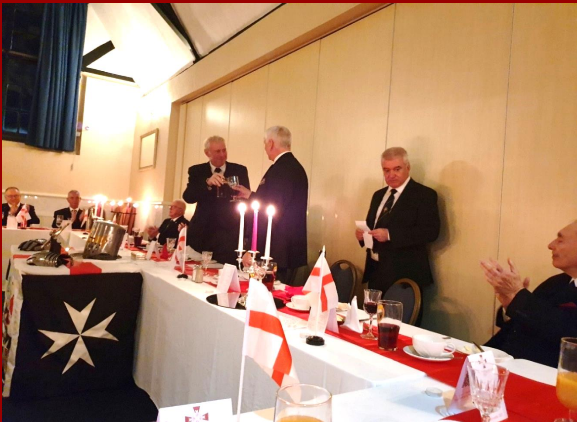
The current and past Eminent Preceptors raising their glasses.