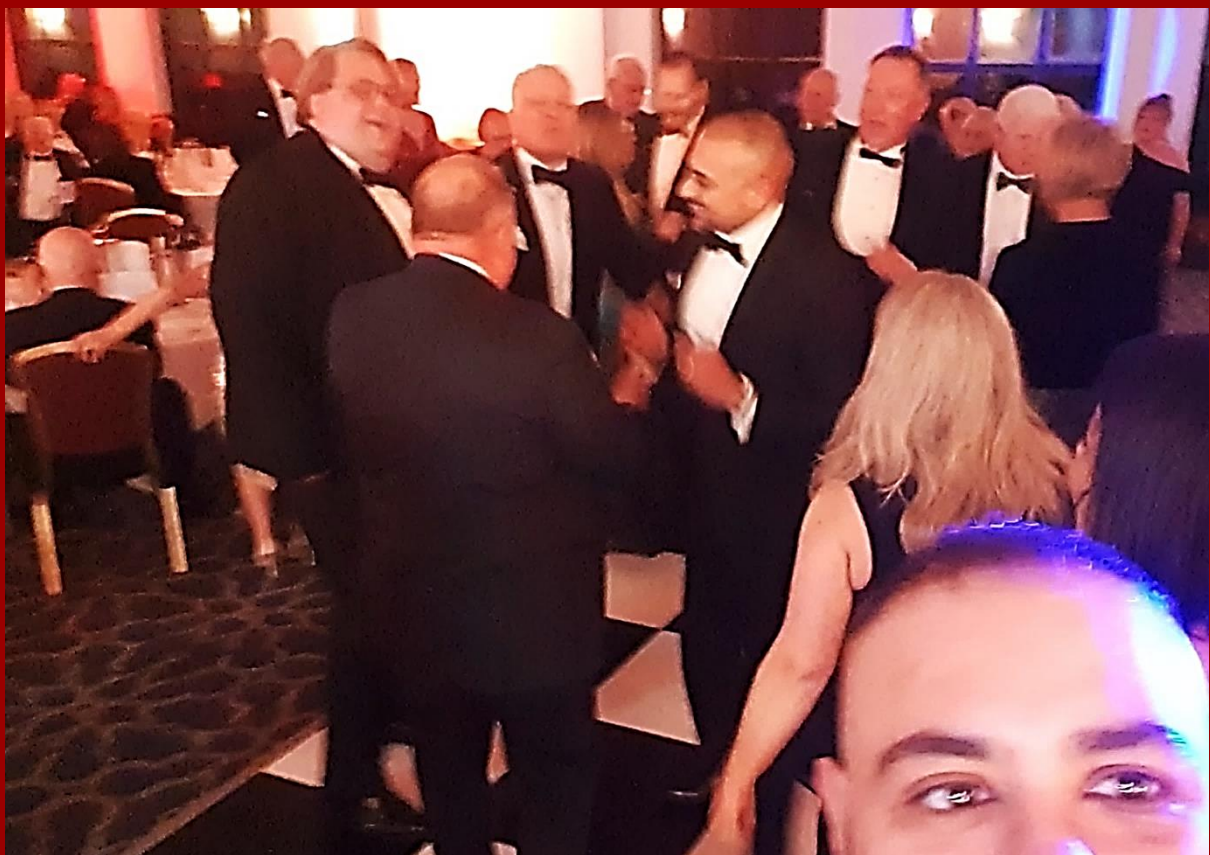
Brother Knights performing their best dad-dance moves!