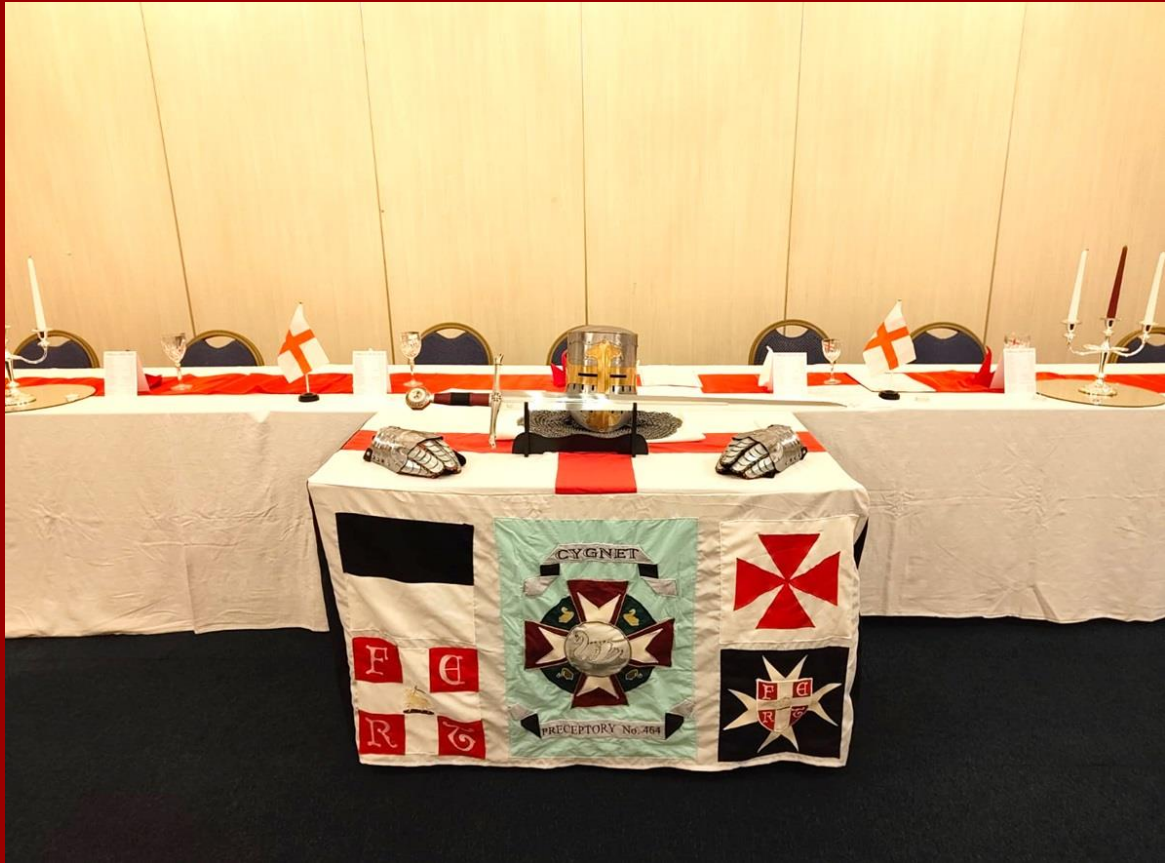
An excellent centre piece!