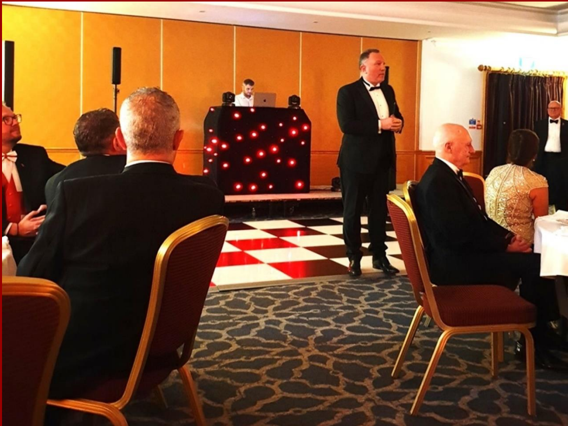
The Provincial Prior speaketh!

We also relished exquisite dining and were audience to excellent speeches!