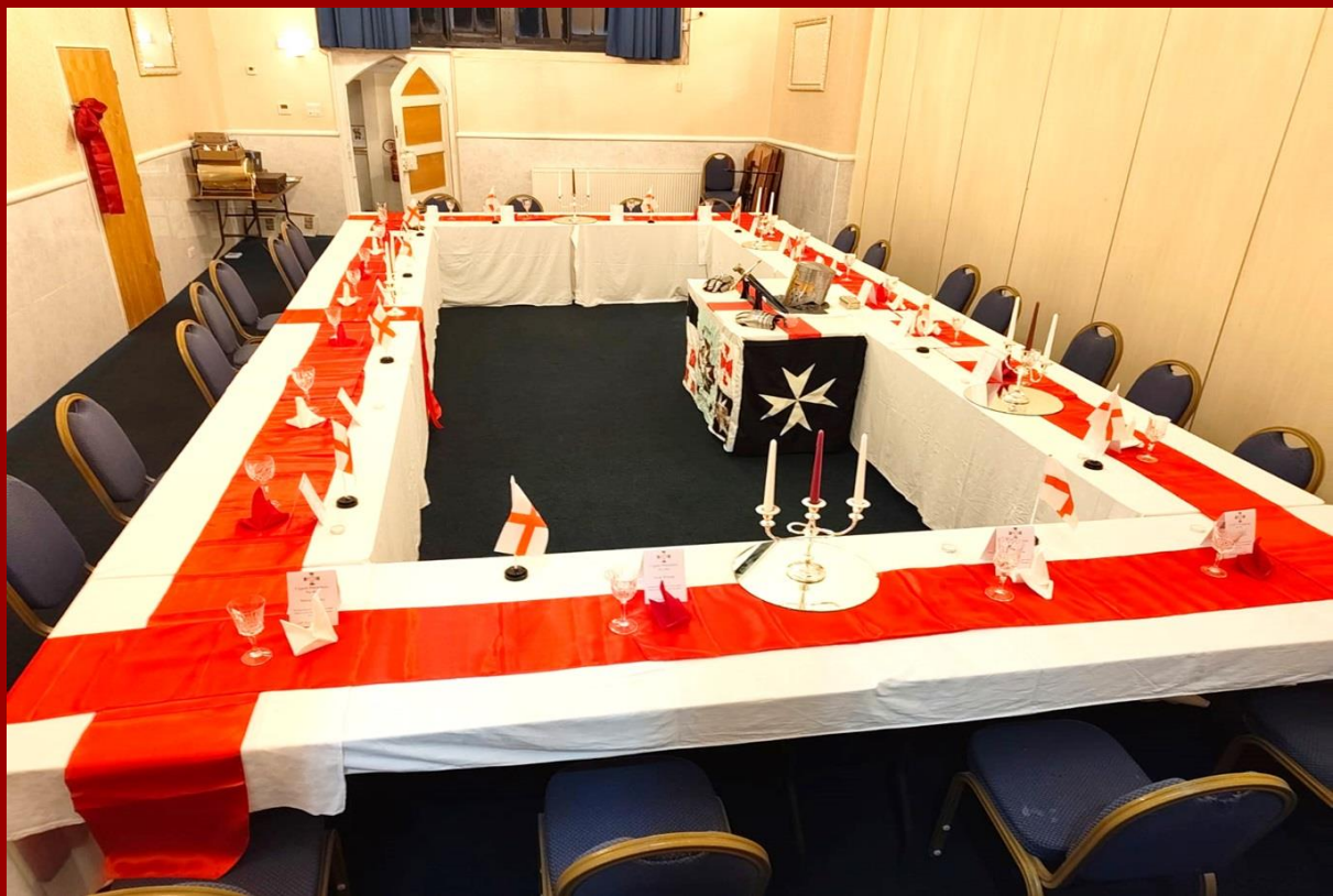
E.Kt. Graham Snell's table set-up is always applauded!