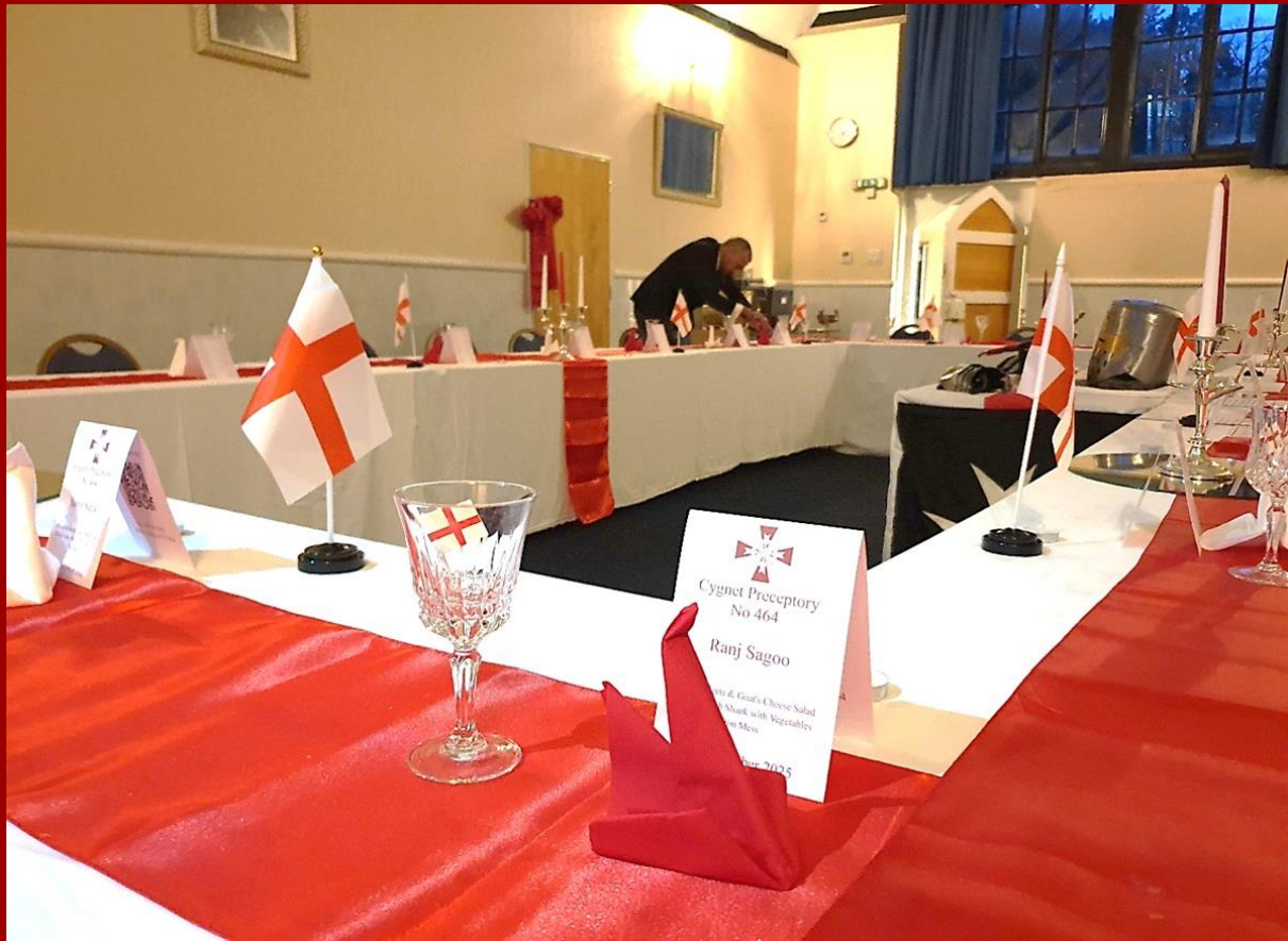
Kt. Ranj busy placing over 30 napkin swans he made!