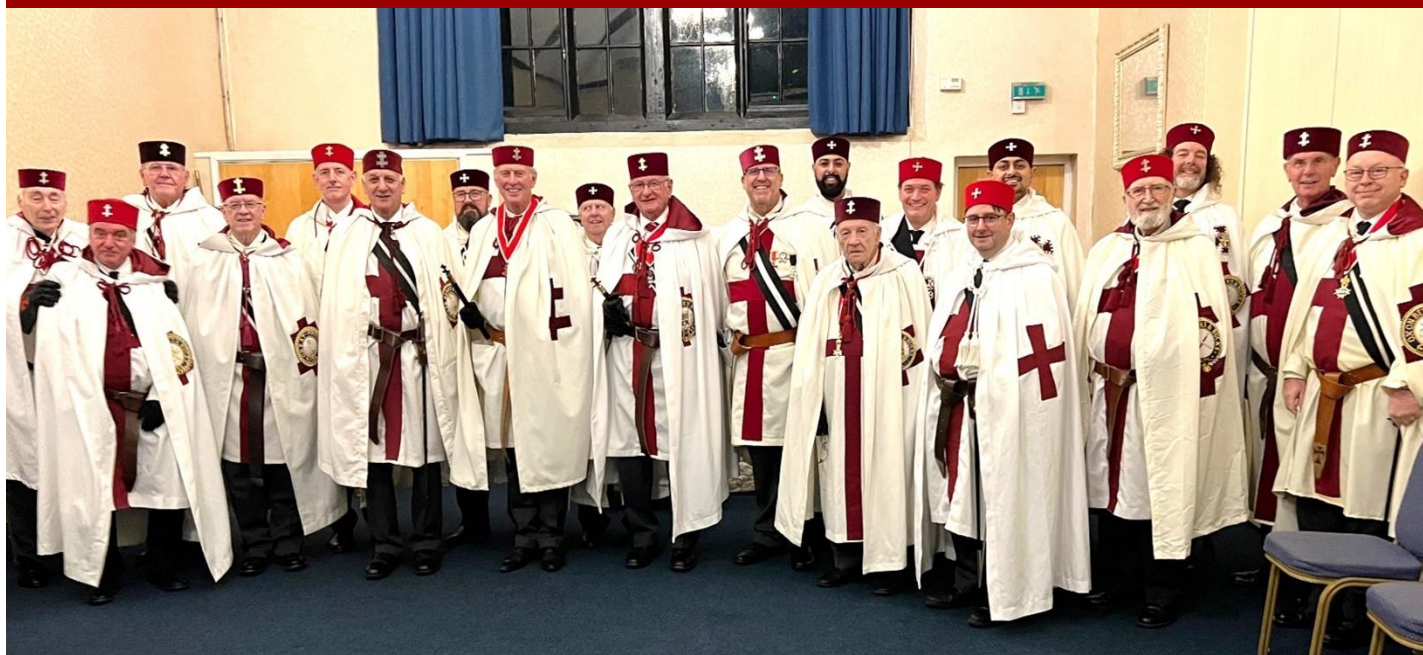
A smart group shot after the excellent ceremony.